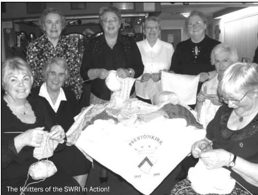
The Knitters of the SWRI in Action!