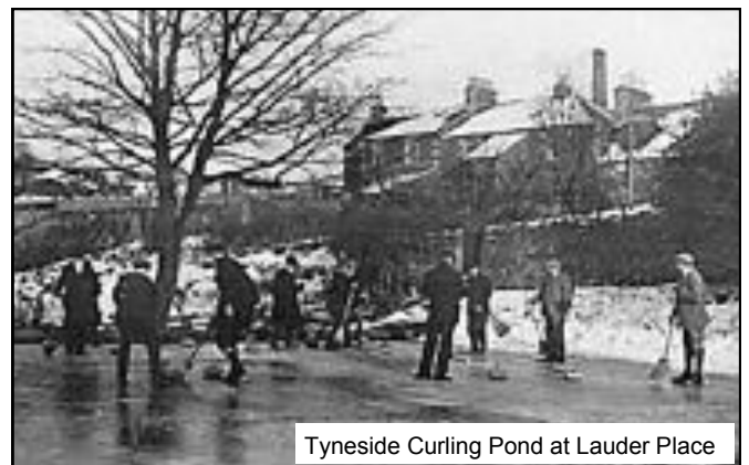
Tyneside Curling Pond at Lauder Place