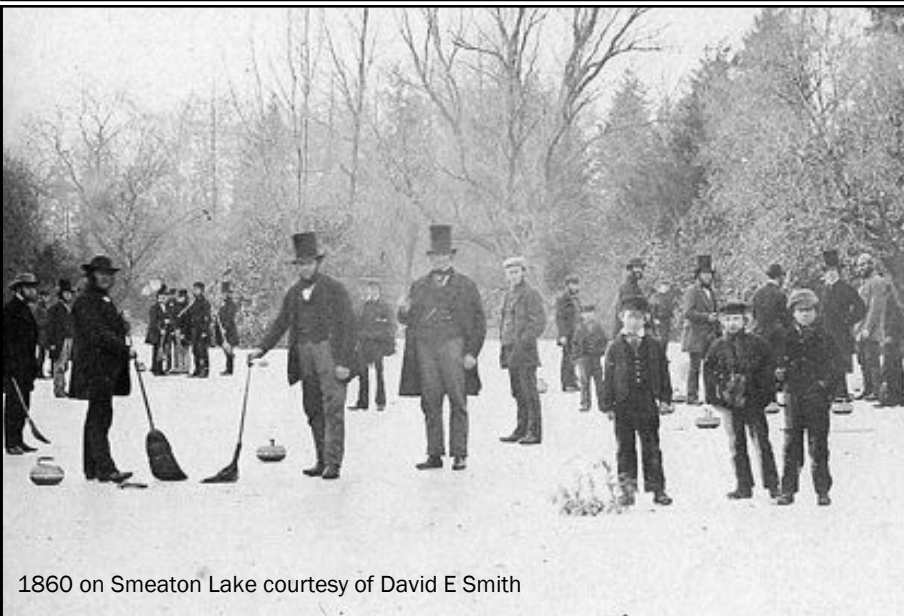
1860 on Smeaton Lake