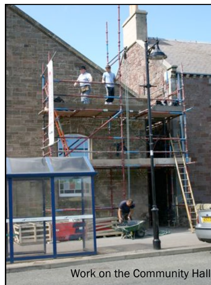
Work on the Community Hall

While Hall rents just about pay the bills [around £250 a week], we rely on the 200 Club to pay for repairs so please consider joining to support your Hall. The Hall is not owned by the Council but by you, the residents of the East Linton area. It's run by East Linton & District Community Association which is a completely separate organisation from Dunsperder Community Council and is made up of both elected members and also representatives from the various groups. Some of us have been on the committee for a long time and it's probably time to hand over to a new team at the AGM this autumn. Please consider whether you could give us some help.