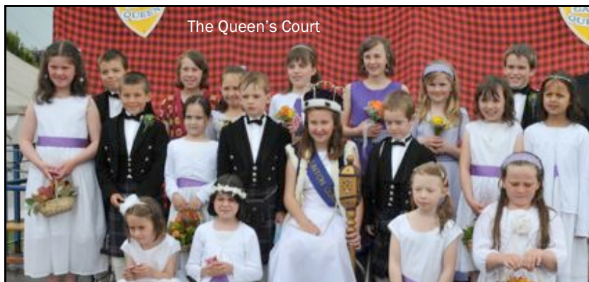
The Queen's Court