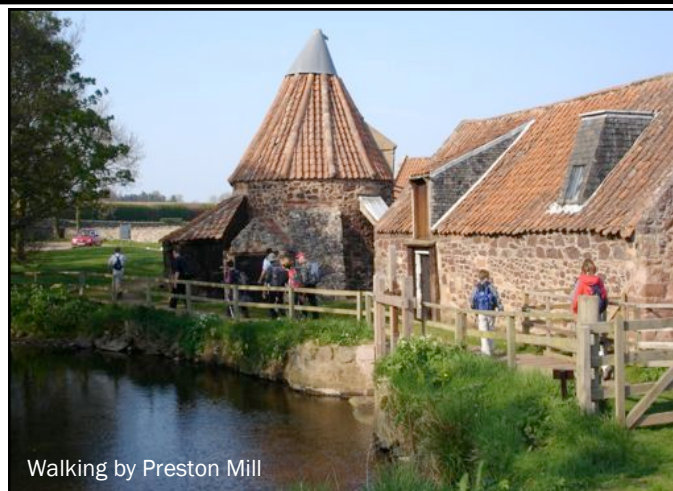
Walking by Preston Mill

Judging from the feedback we have received all those involved seemed to enjoy the festival and many would like to return to experience more of the delights the District has to offer.