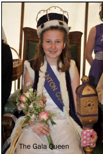
The Gala Queen