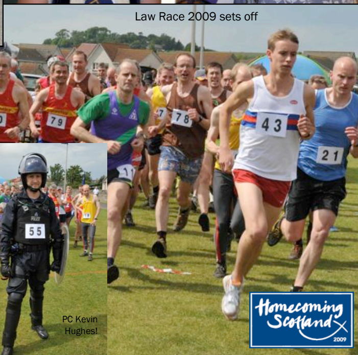
Law Race 2009 sets off