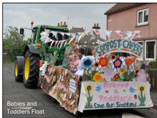
Babies and Toddlers Float