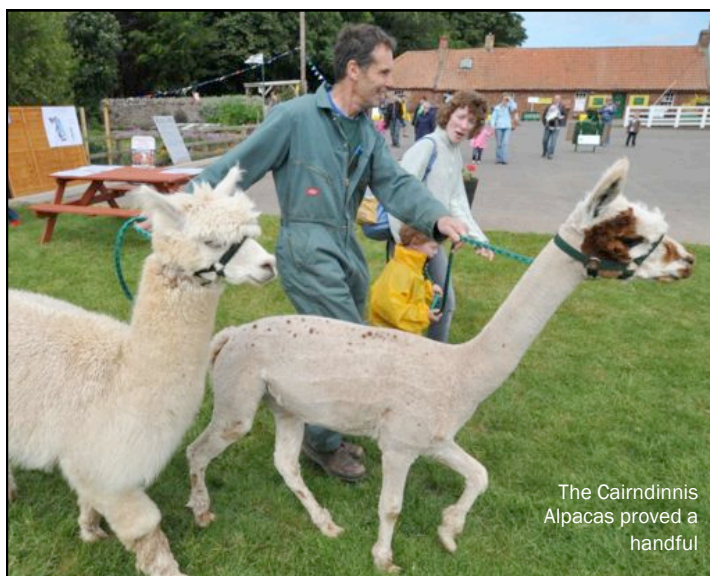
The Cairndinnis Alpacas proved a handful