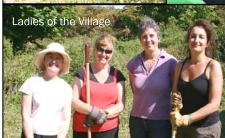
Ladies of the Village