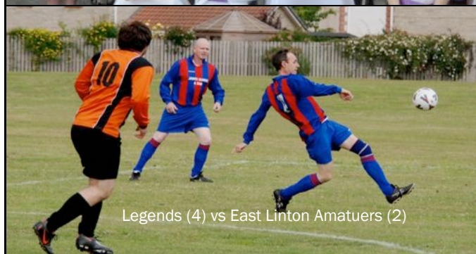
Legends (4) vs East Linton Amateurs (2)