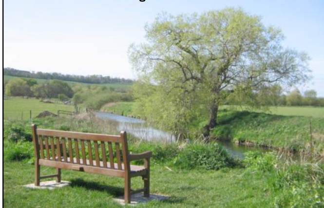
New Seat at Knowes Bridge