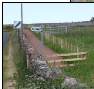
The new road surface through Whitekirk