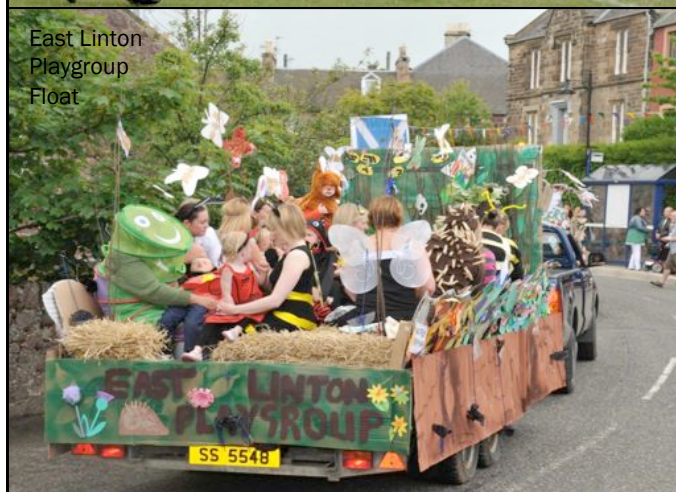
East Linton Playgroup Float